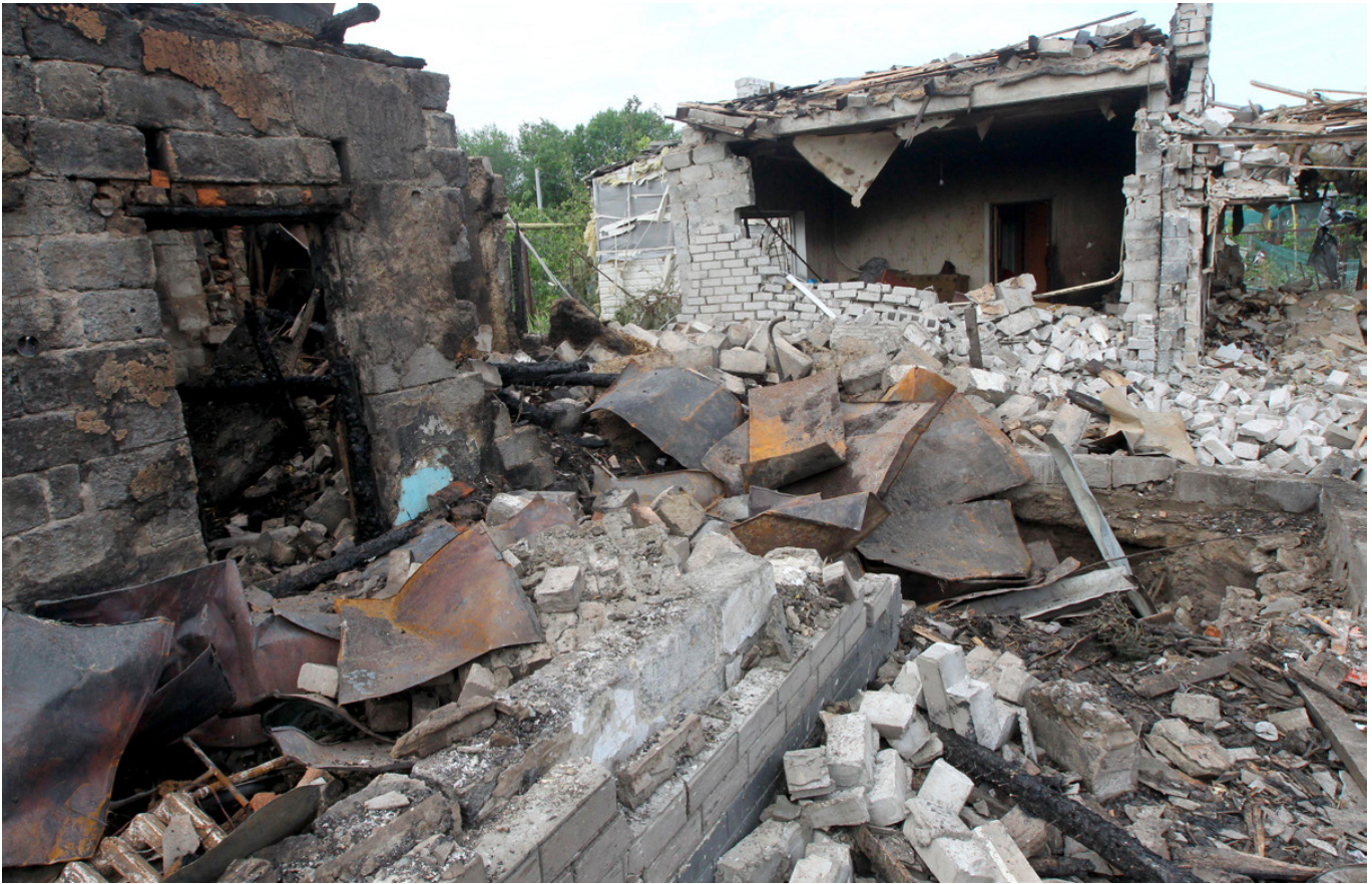
Buildings are damaged by a Russian drone attack in Dnipro, Ukraine, on August 7, 2025. Four people were injured and several fires broke out due to a Russian drone attack on the city of Dnipro on the night of August 6-7.

AT: Many describe taking the CAMS certification examination as demanding. You recently received your CAMS certification following a particularly harrowing experience—a Russian air raid that ended just minutes before the exam began. How were you able to successfully complete the exam?